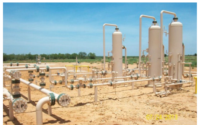
Emerson's 3-phase separator solution installed at the Eagle Ford Shale site

This solution was installed and commissioned by Emerson's Lifecycle Care service field technicians. The entire solution has enabled the company to establish a standardized design for each shale well pad with standard protocols for setup and programming of monitoring equipment by the field technician.